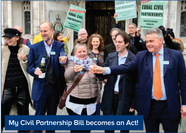
My Civil Partnership Bill becomes an Act!

Earlier this year I succeeded in getting a remarkable piece of legislation through Parliament under the Private Member's Bill mechanism and in May 2019 the 'Civil Partnerships, Marriages and Deaths (Registration etc) Act' became law. Normally private member's bills stand little chance of getting through Parliament and contain just a single simple measure. In this case, my Bill included no fewer than four potentially contentious separate measures on issues I have campaigned for over many years. I succeeded against the odds and the result