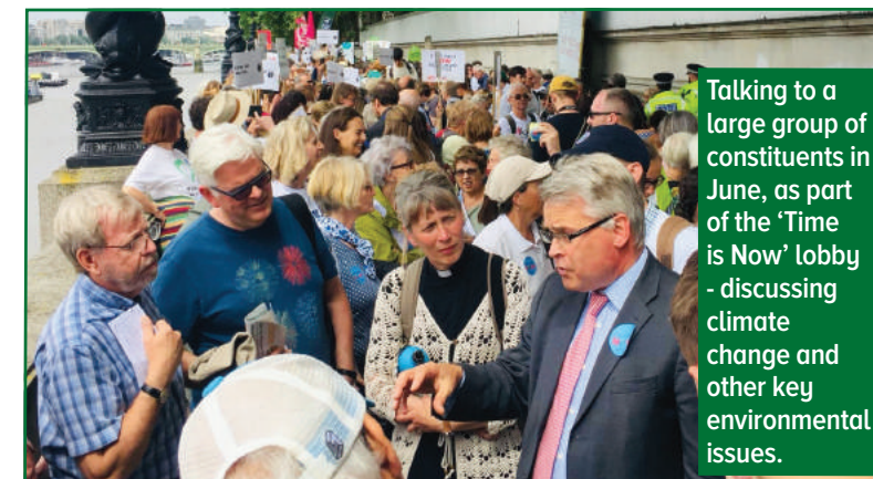
Talking to a large group of constituents in June, as part of the 'Time is Now' Lobby - discussing climate change and other key environmental issues.

Long after we have sorted Brexit, climate change will be the biggest challenge facing this country and our planet.