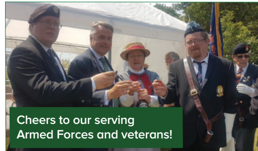
Cheers to our serving Armed Forces and veterans!

With a lot of veterans living in and around Worthing I am always keen to support the military and local military charities, including the annual Drumhead Service as part of Armed Forces Weekend in June. I have spoken out against the outrageous treatment of Northern Ireland veterans now facing possible charges for action they took doing their duty back in the 1970s whilst IRA terrorists went unpunished. This is an issue I feel strongly about and support the plans by former Defence Secretary Penny Mordaunt to give them proper protections and immunities. I was delighted to hear that Boris Johnson has created the new 'Office for Veterans' Affairs' which will provide lifelong support to military personnel - overdue but hugely encouraging.