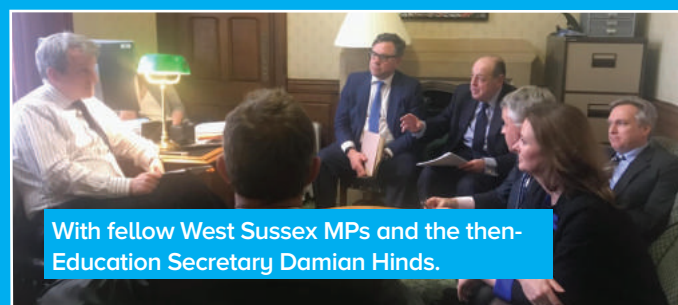
With fellow West Sussex MPs and the then-Education Secretary Damian Hinds.

Sussex schools since before the last election. I have held a series of 'roundtables' inviting every head and every chair of governors from every school in the constituency and most weeks I am visiting a local school. As a result, the funding formula was changed, and West Sussex received an additional £28m which was very welcome but only goes part of the way. If we level up from the current £4600 per pupil to an indicated £5000 that should fit the bill of what local heads have been asking for.